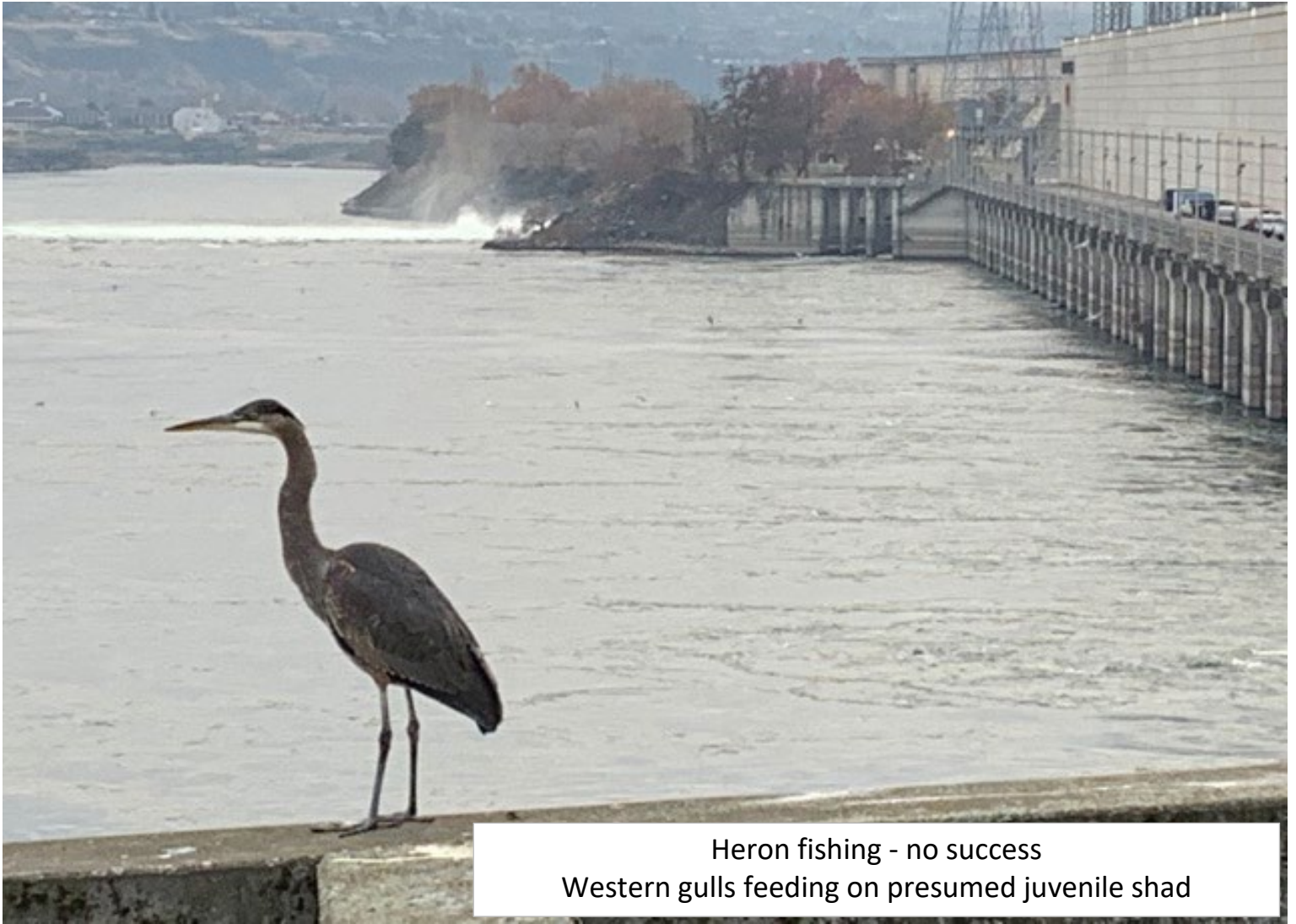
Heron fishing - no success Western gulls feeding on presumed juvenile shad